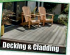
Decking & Cladding