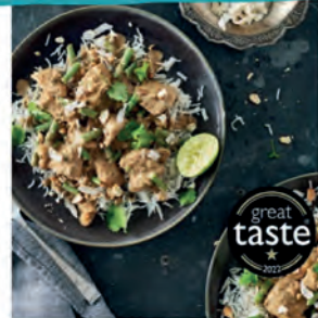
Thai Chicken Satay