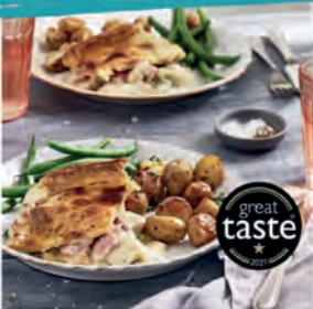
Chicken, Ham & Leek Pie

Cook straight from frozen & enjoy the taste of home cooking