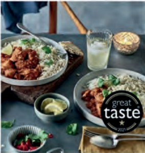
Butter Chicken Curry